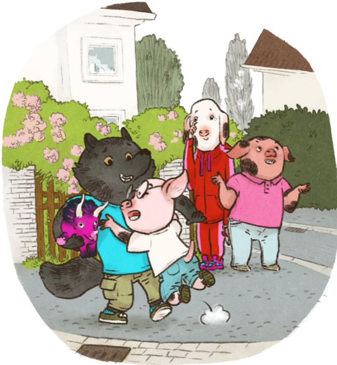
Beware of the wolf Vignette Personal work