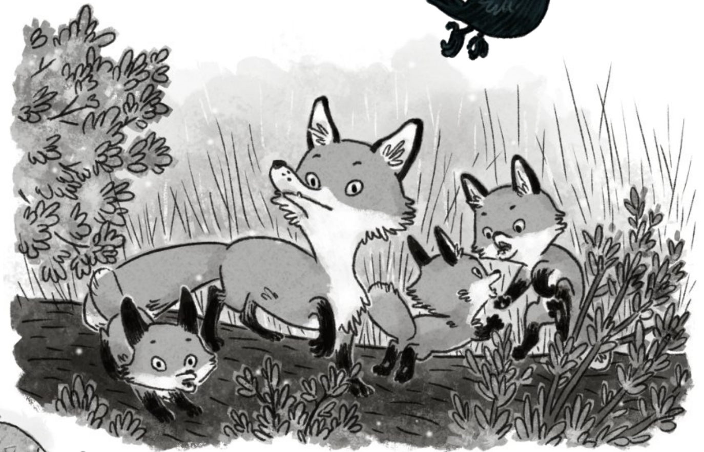
Ronja, the robber's daughter

Half-page illustration | Spot illustrations