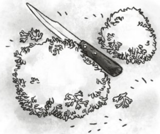
Ronja, the robber's daughter

Cover illustration, lettering | Spot illustration